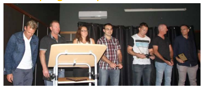
Corporate Partners being acknowledged for their tremendous support.